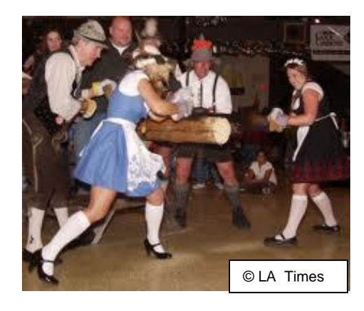
Log Sawing Contest at Big Bear Oktoberfest

Conclusion: The family tradition, costumes, and entertainment make Oktoberfest a unique holiday experience that I look forward to every year.