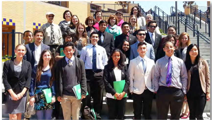
Honors Transfer Program students assemble after an outstanding showing at annual conference.

This conference is designed so that community college honors students can present their research in a university setting. In addition, most students will have their abstracts printed in a UC Irvine publication.