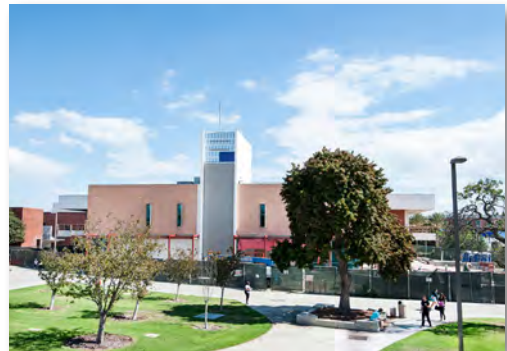
The former Math & Computer Science Building will be completely renovated to house Industry & Technology programs.

These improvements are made possible by funds from the 2002 Measure E facilities bond and will provide updated technology and equipment for student use. Future 2015 projects include repairs to the Channel Parking Lot F, the design phases of a new five-level parking structure at the north end of campus and the Student Services Center replacement project.