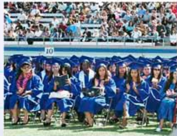
Graduation 2008: graduates celebrated their success at El Camino College's 61st Annual Commencement on June 6, 2008 in Murdock Stadium.

"El Camino College really gave me a solid foundation across the board," he said. "I think that's because the teachers at El Camino really cared. It was an awesome time, and it prepared me well."