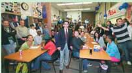
MESA scholarship winners celebrate win.