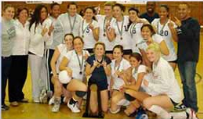
Women's Volleyball Team.