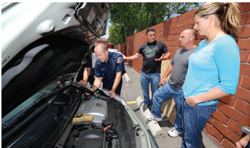
Participants of the ECC Alternative Fuel Training program learn about the higher voltage battery connections of electric cars.

For more information, contact ECC's Center for Customized Training at 310-973-3158 or businessassist.elcamino.edu/customizedtraining .