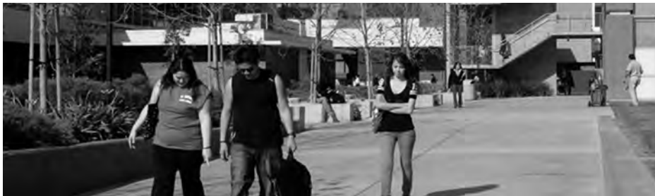
Table of Contents General Information