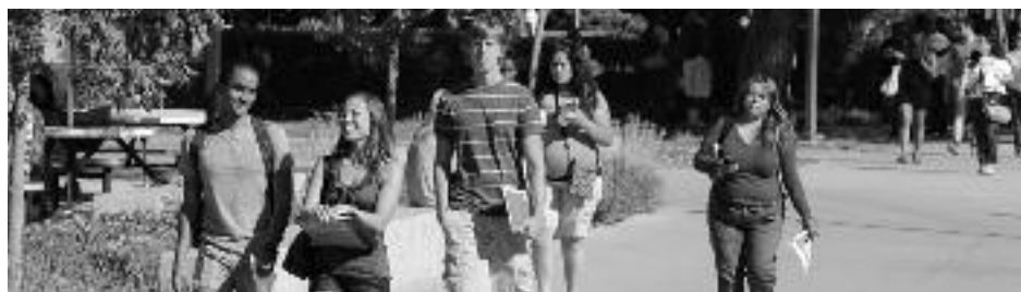
Table of Contents General Information