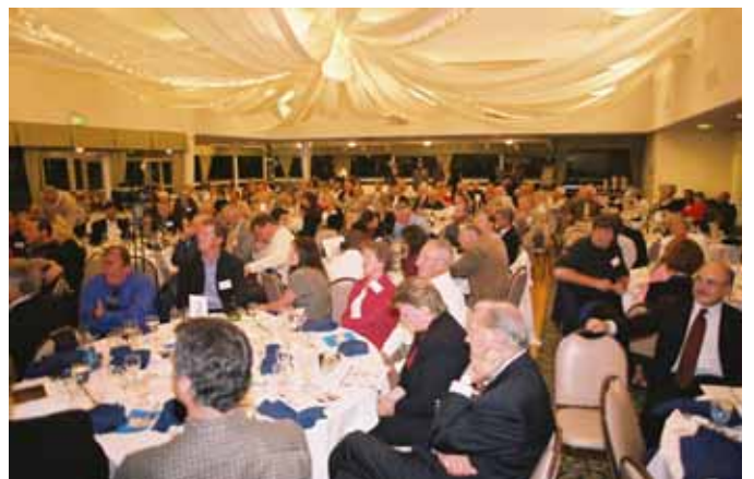
2007 ATHLETIC HALL OF FAME BANQUET AND INDUCTION CEREMONY