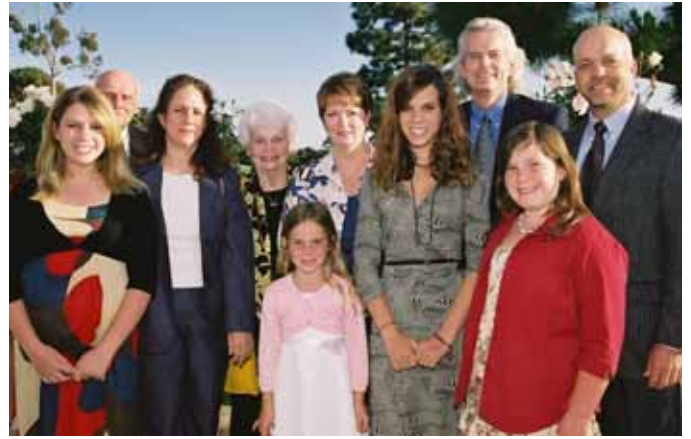
THE DREIZLER FAMILY