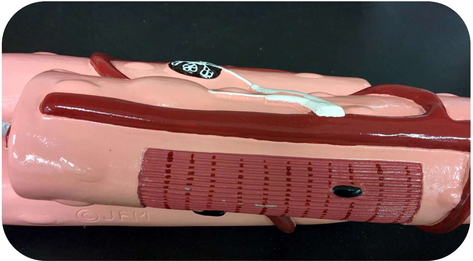
Skeletal Muscle Tissue 1. Multinucleate 2. Strong striations