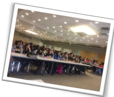
INROADS paid internships workshop booked to capacity!