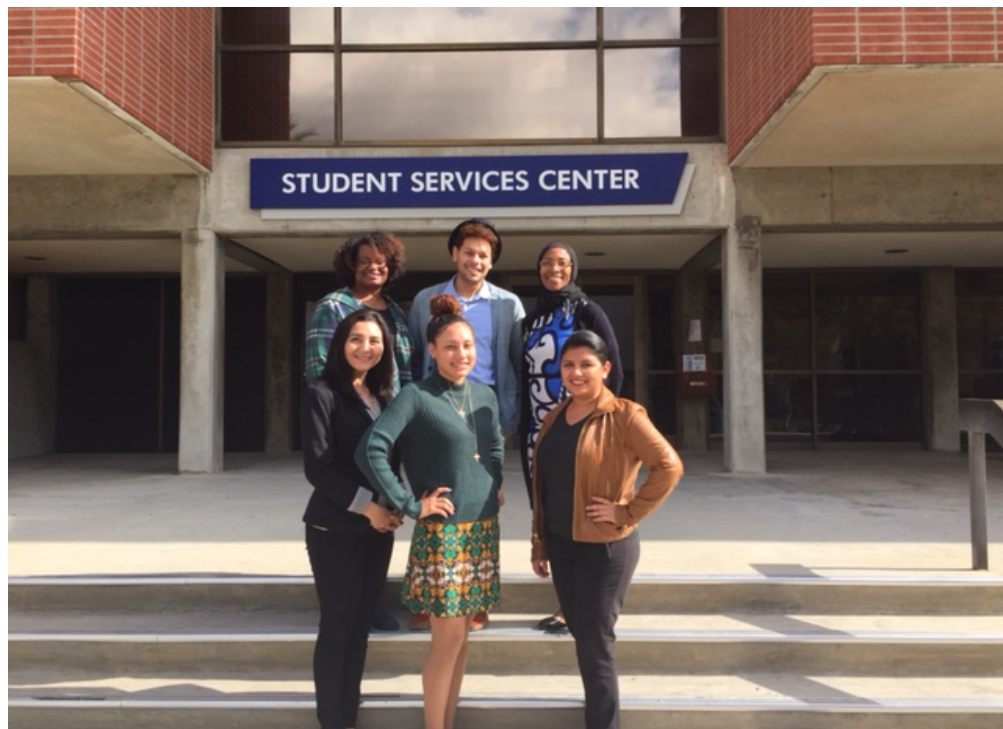
EL CAMINO COLLEGE CAREER CENTER