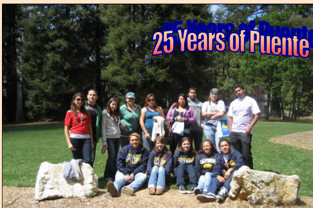
Spring Break 2008, students tour Northern California universities.