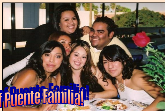
Puente 20 celebrates friendship and accomplishment.