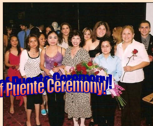
Puente enjoys its 2006 End of Year Celebration.

El Camino College's Puente Program went on to enjoy decades of achievement, due to the dedication of its students, instructors, counselors, administrators, mentors, and community.