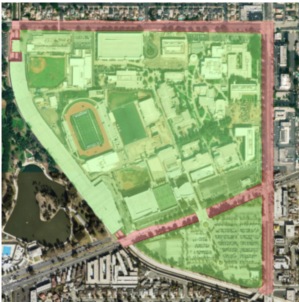
El Camino College