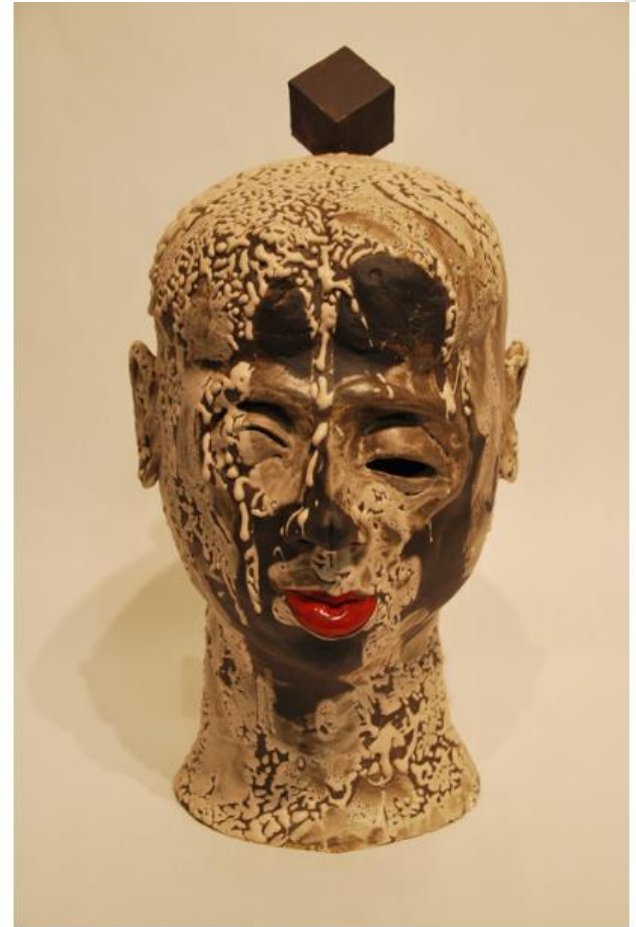
Zane Dowd; Overwhelmed By Its Conundrum ; Ceramic; 21" x 11" x 14"