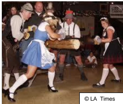
Log Sawing Contest at Big Bear Oktoberfest

Conclusion: The family tradition, costumes, and entertainment make Oktoberfest a unique holiday experience that I look forward to every year.