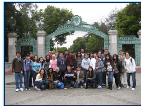
UC Berkeley Tour Spring 2011

In Spring 2011, thirty math, engineering, and science students had the opportunity to participate in a four-day Northern California Tour specifically organized for STEM students. This tour was designed to visit four main campuses: UC Merced, UC Santa Cruz, UC Berkeley, and UC Davis. Students were taken on a charter bus and received hotel accommodations when needed, but also the opportunity to stay at campus dorms like at UC Berkeley. Upon arrival to each campus, students had the opportunity to attend Admissions and student panel presentations, campus tours, and also free time opportunities to check out particular campus spots or STEM resources.