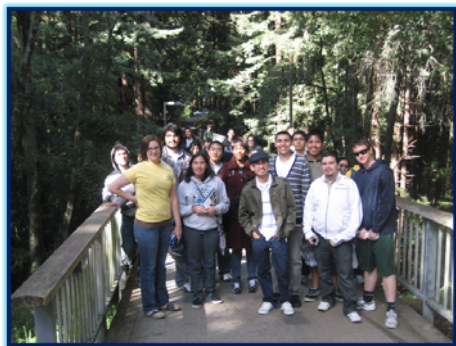
UC Santa Cruz Tour Spring 2011

This activity helps students visualize and experience their potential transfer campuses. Through this experience students gain a better understanding of the campus atmosphere throughout each