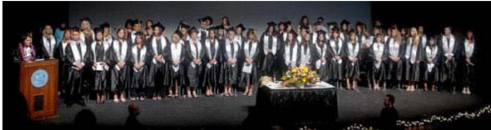
Moorpark's nursing class (48 students) of Spring 2010 during the graduation ceremony.

That means California needs to graduate 10,000 registered nurses a year to avoid a shortage.