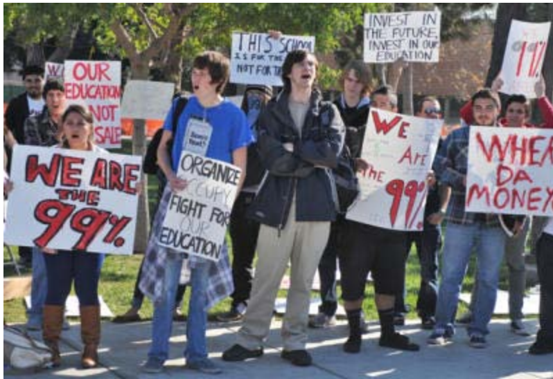
Protesting students march with signs at El Camino College after walking out of classes on Thursday to protest cuts to counselor hours and general college cutbacks.