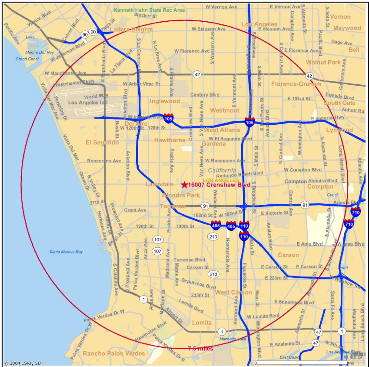
Figure – 1 District Location

The El Camino College (ECC) campus is located in the southeastern corner of Los Angeles County. The El Camino Community College District encompasses eight cities and one unincorporated area of Los Angeles County: El Segundo, Hawthorne, Hermosa Beach, Inglewood, Lawndale, Lennox, Manhattan Beach, Redondo Beach, and Torrance.