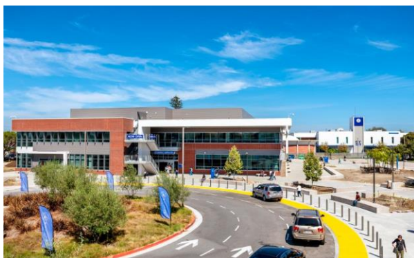
The new 80,000 square foot Student Services building is now open making it easier for students and first-time visitors to access information and services.