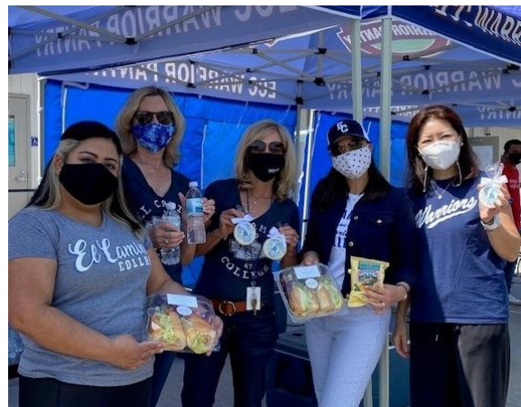
Foundation serving lunches & smiles under masks