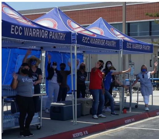
Waves of support for our wonderful faculty