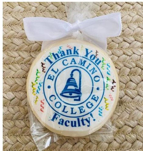
Cookie from Torrance Bakery