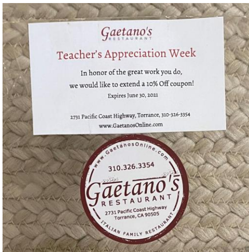
Teacher Appreciation from Gaetano's