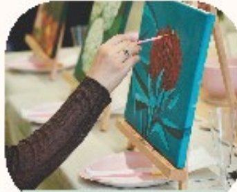
ART & NATURE THERAPY GROUP