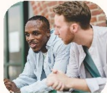
MEN'S THERAPY GROUP