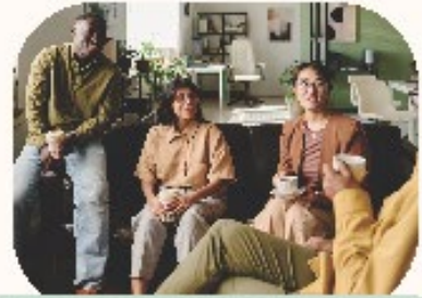
THE MEETING PLACE: NEURODIVERSE SPACE