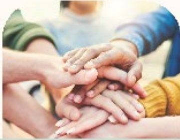
IN THIS TOGETHER: COMMUNITY TALKS