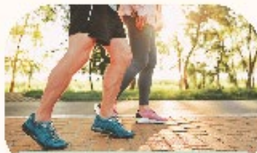
MENTAL HEALTH MORNING WALKS