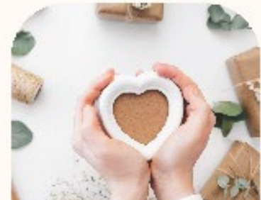
CENTER FOR WELL- BEING ACTIVITIES