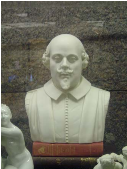
The Bard Looks Forward To Seeing You This Month