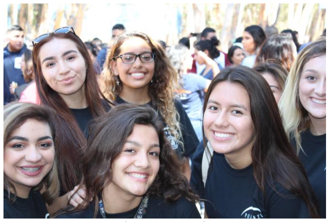
Puentistas gather at the Transfer Motivational Conference at UC San Diego. Each fall, cohorts from all over Southern California convene to tour a campus and learn about how to turn their transfer dreams into realities.

If they can accomplish all of this in 14 weeks, what might they achieve next semester and in the coming years while they complete coursework at ECC before transferring? What might they accomplish when they transfer, and when they graduate with four-year degrees? Only time will tell, but with this growing, vibrant group, the future looks bright indeed.