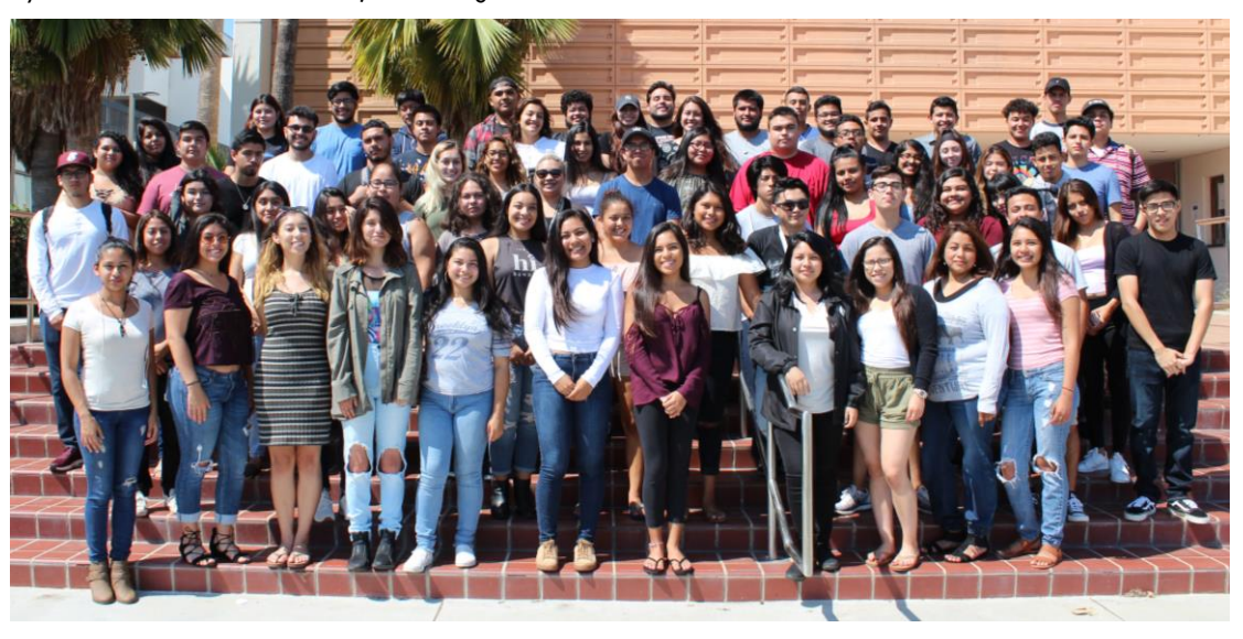
Two cohorts of Puente 32 students gather for a group picture on campus. Finding a space big enough for the whole familia is a new and welcome challenge now that Puente has doubled in size.