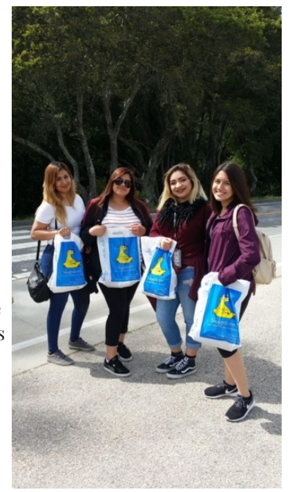
PHASE 2 PUENTISTAS JOIN PHASE 3 STUDENTS ON A TOUR OF UC SANTA CRUZ