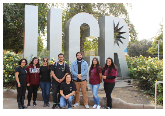
OUR ECC FAMILIA VISITS PUENTE ALUMNI AT UC RIVERSIDE

preparing for the successes to come, we also organized a trip to the Autry Museum in Griffith Park, where students and their mentors celebrated photographs of the Chicano Rights Movement between the years of 1967-1977. Our last event of the semester is our End-of-the-Year Banquet, in which we celebrate the Puentistas who worked all year to complete Phase 1 and 2 of our program, those who are graduating, and those who are transferring. Spring 2018 left us with many reasons to celebrate and with an excitement for what's to come!