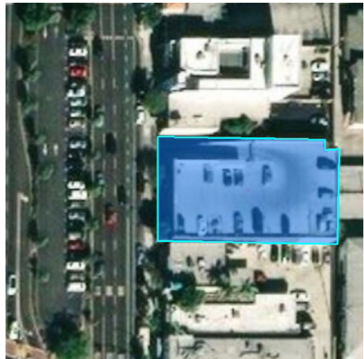
Business Training Center